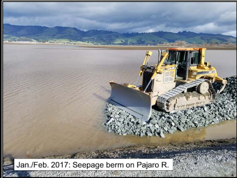
Jan./Feb. 2017: Seepage berm on Pajaro R.

December 2019 Director's Report and Final Feasibility Study