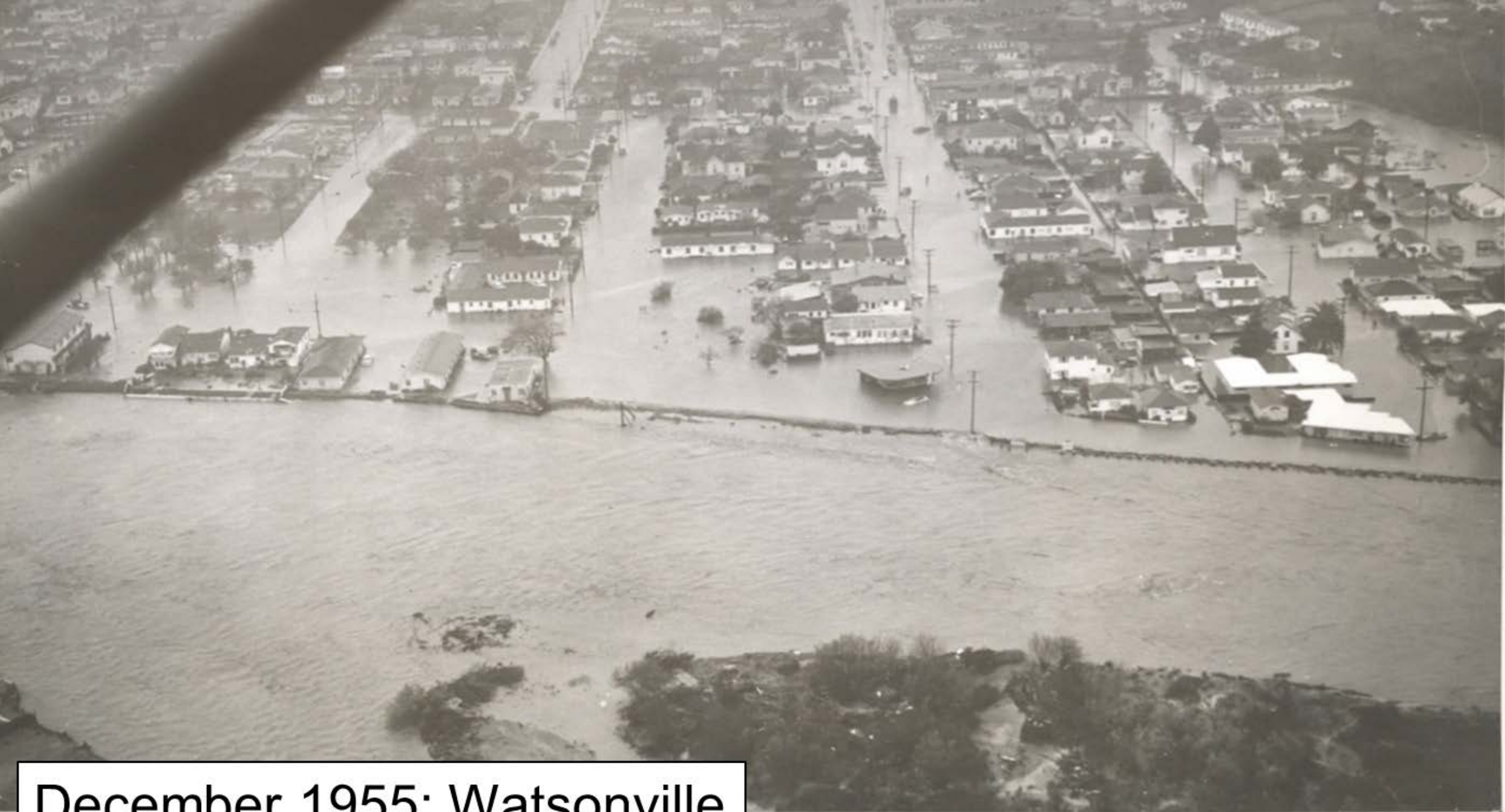
December 1955: Watsonville