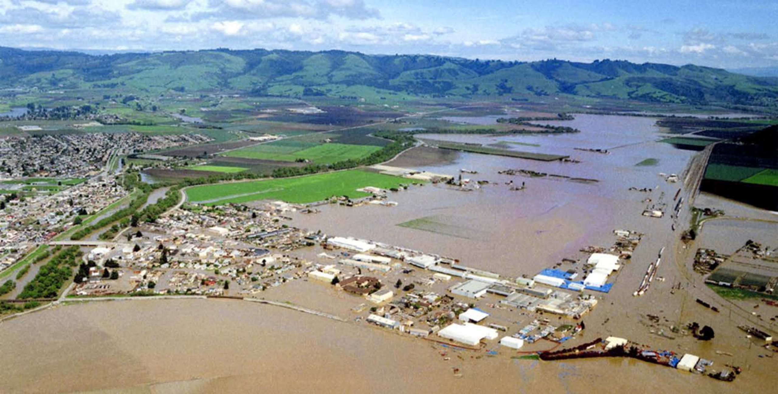
March 1995: Town of Pajaro